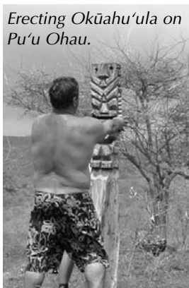
Erecting Okūahu'ula on Pu'u Ohau.