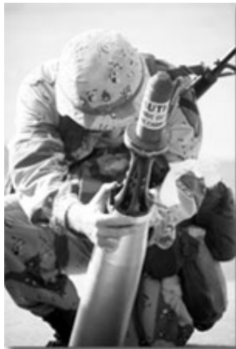
U.S. soldier using a DU shell.

932 soldiers had moderate to and after the Gulf War I.