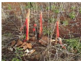
Photo: Davy Crockett tailfins found at Schofield